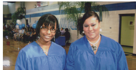
Carver Middle School Winners