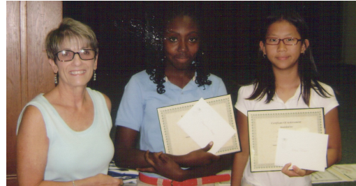
Oak Park Middle School Winners